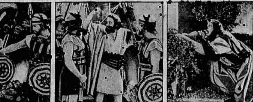
At the cock crowed in the distance, Peter remembered the words of Jesus...