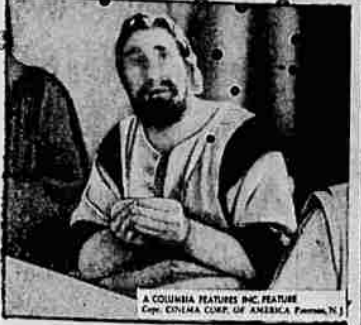
Peter mingled with the crowd hoping to learn the Master's fate...