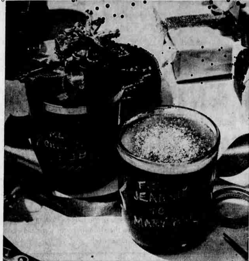
It's a simple task these days to make gift products from your kitchen.

If holiday activities are keeping you too busy to do something of the little things for neighbors and friends, do your holiday "shopping" in your own kitchen—in other words, make some jams and jellies for gifts. These recipes for Pineapple-Strawberry Jam and Spicy Peach relish take less than 15 minutes to make and certainly they are nice gifts. There are simple jellies to make, too. Frozen, canned or dried fruits do the trick. You can further personalize the gift with wrapping it and in decorating the card that goes with it—your imagination being the limit.