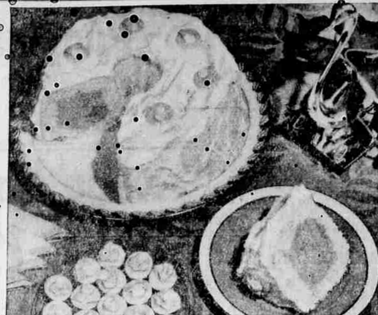
They call it surprise cake, and it is delicious to eat.

Capital Drug Store 405 State Street Corner of Liberty 2nd Green Stamps