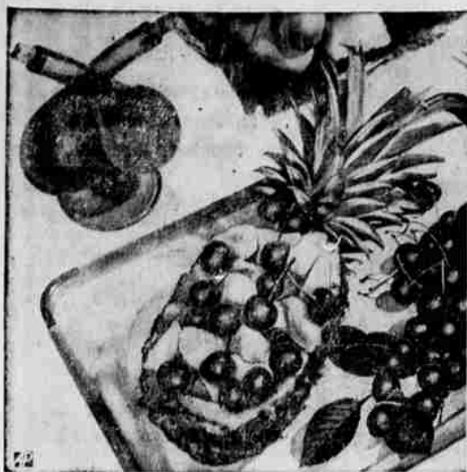
Help-Yourself Salad features sweet red cherries, fresh pineapple and bananas. French dressing, salad greens and cottage cheese are good go-alongs.