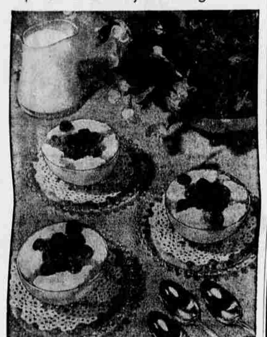
A fine dessert for the summer meals.

For special occasions we like elaborate desserts that take time and effort, but for most occasions the simpler, easier and less expensive ones are appreciated and