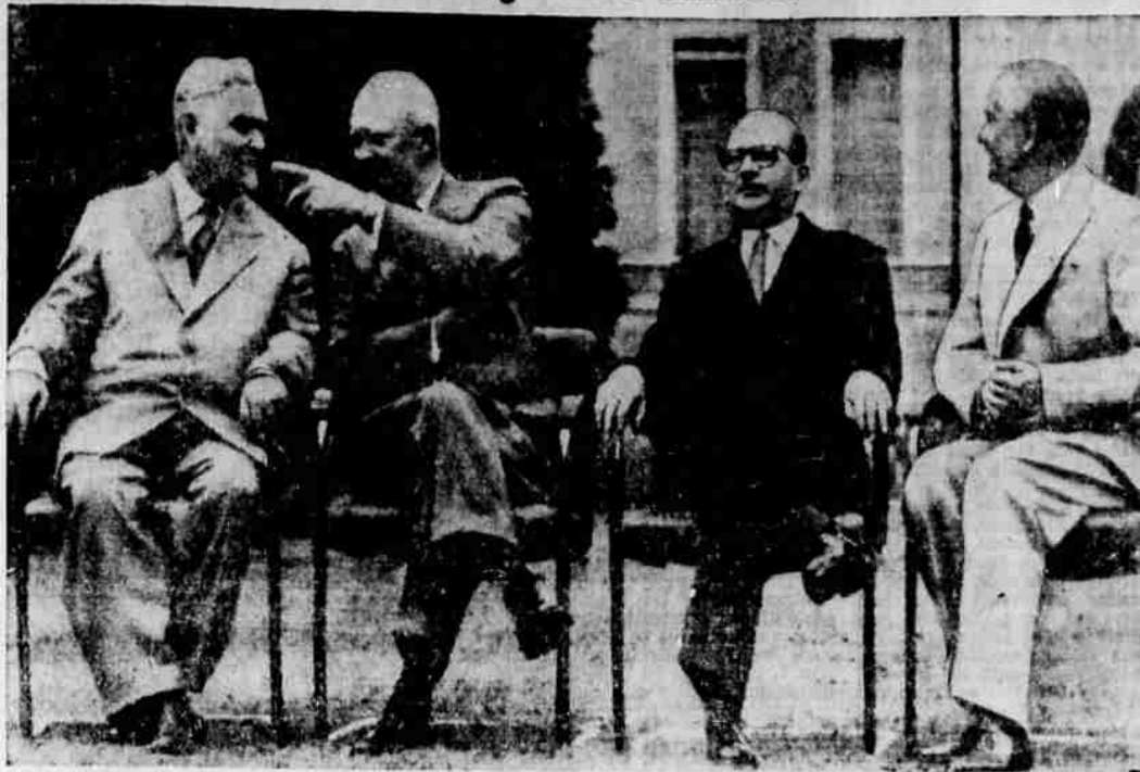
President Eisenhower gestures as he holds the attention of Russian Premier Nikoal Bulganin, French Premier Edgar Faure sits with legs crossed as he looks toward photographers, and Britain's Sir Anthony Eden appears interested in Ike's conversation as the Big Four pose in the garden of Geneva's United Nations building between conference sessions July 19.