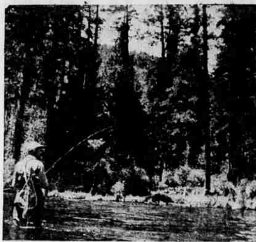
Flies Only This stretch of the Metolius river above 99 Bridge is reserved to fly fishing only. Though most of the fish taken are small, they put up a tough scrap in the crystal clear, 44 degree water. Marshall Hanft, Salem, is the angler.