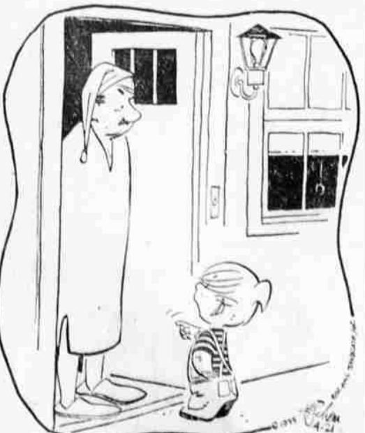
"SLEEPIN' IN THOSE CLOTHES?"