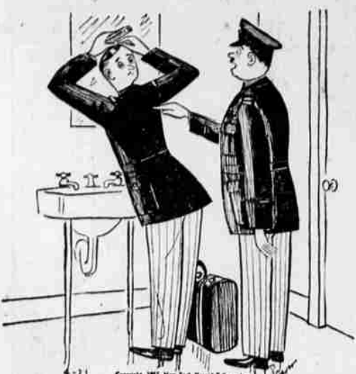
"They've cut the Army's man power, Lieutenant. I'm afraid you'll have to do KP this week."

8:30 p.m., Topper —After his boss is swayed from inveigling Cosmo Topper into a phony uranium deal, the boss gets taken in on a similar deal himself and Topper gets the blame. 9 p.m., Playhouse of Stars —Don Taylor stars as a bank clerk who is hard-pressed to explain the absence of $5,000 in his day's receipts. 9:30 p.m., Our Miss Brooks —Teacher Connie Brooks, trying to evoke some attention from romance-shy biology teacher Mr. Boynton by changing her hairdo with theatrical wigs, convinces Mr. Boynton and Principal Osgood Conklin that it's the inside of her head that needs attention. 10 p.m., The Line-Up —When a San Francisco woman is found severely beaten on a lonely street, Lt. Ben Guthrie and Inspector Matt Grebb proceed to uncover the criminal in a novel way. 10:35 p.m., Showtime on Six —"Another Chance" with Freda Jackson, Rene Ray and Lois Maxwell.