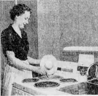
Whether it's a quick lunch or a full-course banquet, PGE electricity is ready to do a fast job at the flip of a switch. Cost? ... only 2¢ a day!