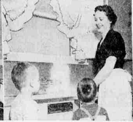
Ever-present hot water for dishwashing, bathing, cleaning house or doing the laundry is a priceless luxury—yet you get 21 gallons for a nickel!