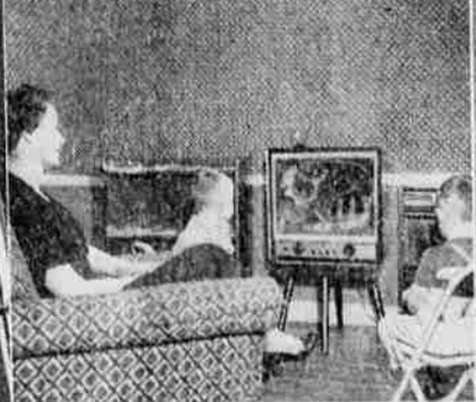
The magic of electricity brings television entertainment for the entire family. The cost? ... 3 hours for a penny!