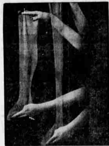
Unique Stretchability . . . . . Here's how Stocking X looks when small - yet see how it stretches to your exact stocking size. Can't wrinkle even at ankle.

OPEN FRIDAY, 9:30 A.M. until 9 P.M. - other week days, 9:30 to 5:30