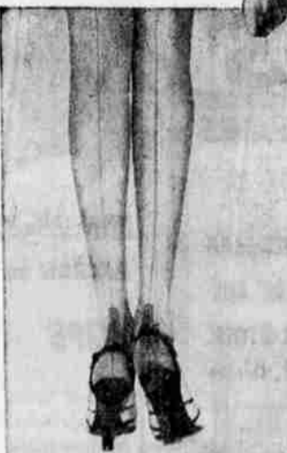
Won't Bind, Bag, Sag . . . . . . . . at the calves or anywhere. Keeps seams straight; conforms to knee and knee dimensions. Fit like they were made for just you.