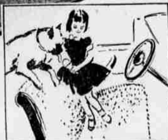
Protects against kiddies and pets.