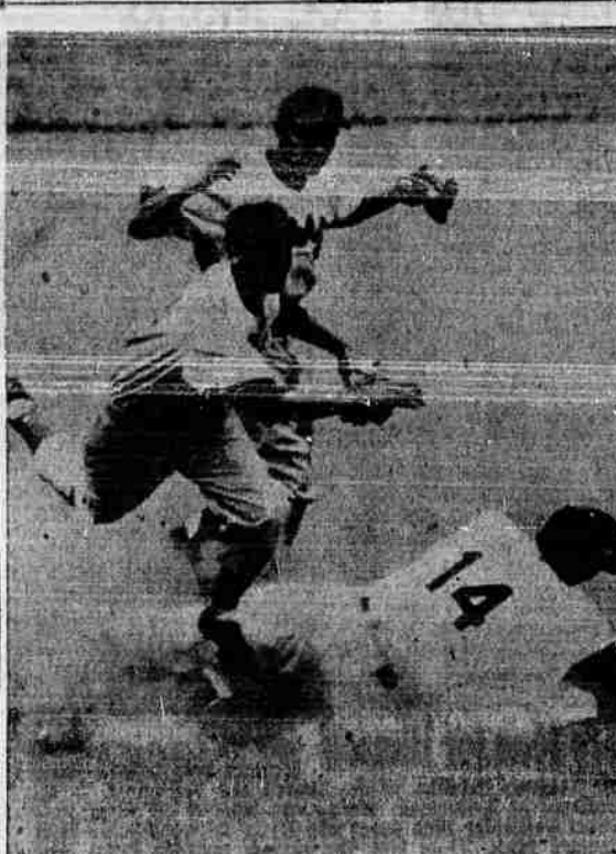
Cubs Blast Bums Gil Hodges (14), Brooklyn first baseman, fails to break up double play as Cubs' shortstop Ernie Banks floats over him and in the same motion whips the ball to first to nip Carl Furillo. Play started when Furillo hit a grounder to Banks. Behind Banks is Chicago second baseman Gene Baker. Scoreless until the eighth at Brooklyn, the Cubs exploded with nine runs to swamp the Dodgers, 9-3.