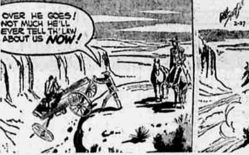
MUTT & JEFF