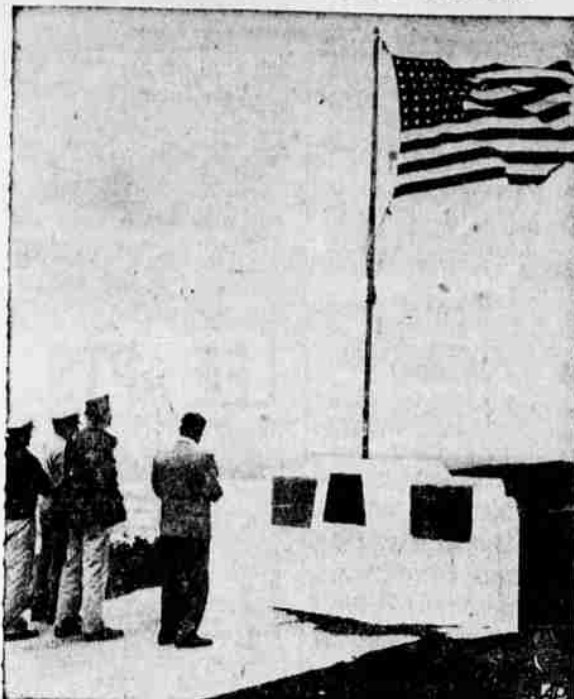
The Stars and Stripes never are lowered at this memorial atop Mt. Suribachi on Iwo Jima where U.S. Marines raised the flag of victory Feb. 23, 1945. The fighting for the Pacific isle cost 20,000 casualties. The Air Force, which today maintains the landing strip on Iwo, raises a new flag above the memorial each week because ocean winds tatter the banner in that time.