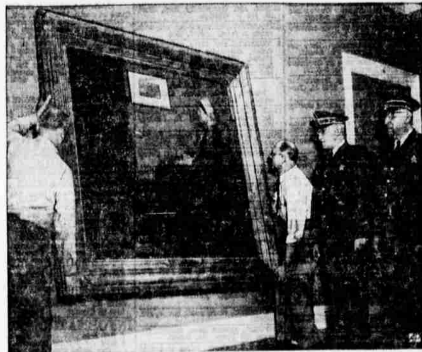
IN AMERICAN SHOW —Guards watch hanging of "Whistler's Mother," valued at $500,000 and loaned by Paris Louvre for exhibition of American artists' works at Chicago.