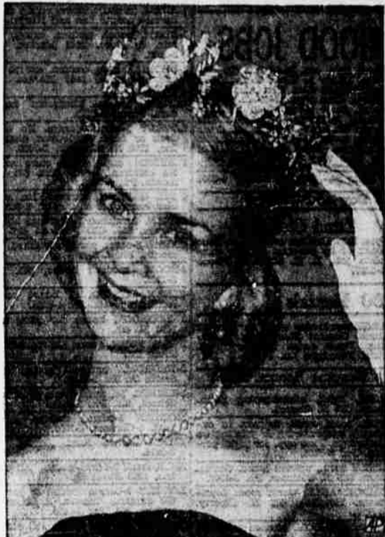
QUEEN OF DIAMONDS —Barbara Ann Scott, ice revue star, wears the $100,000 tiara with which she was crowned Queen of Diamonds by diamond manufacturers in New York. Tiara was formerly owned by the Austrian Imperial family.