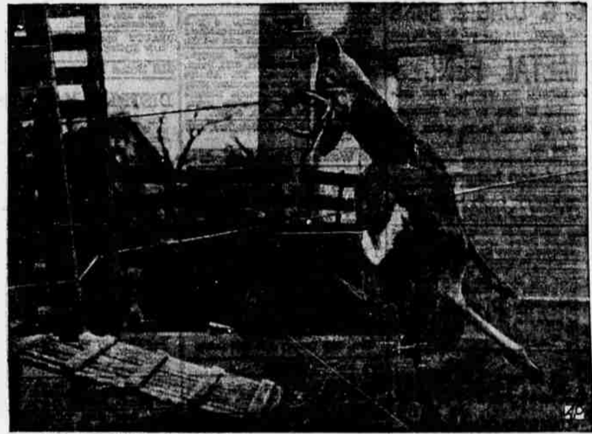
BACK TO THE FOREST —Hambel, a year-old buck deer, is roped for removal to a forest preserve after being reared from fawnhood by Rock Island, Ill., seasonal employees.