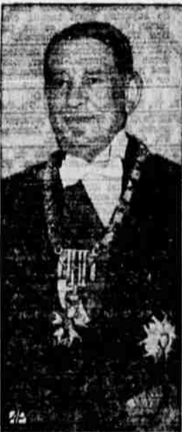
NEW PRESIDENT —French President Rene Coty wears the gold chain and sash of Grand Master of the Legion of Honor in inauguration at the Elysee Palace, Paris.