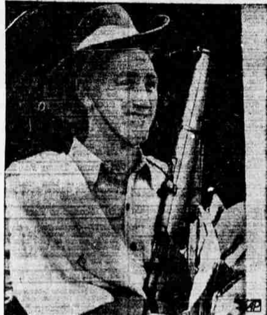
RACKET TO RIFLE —Australian tennis star Lewis Hoad, fresh from his Davis Cup triumphs, leaves a Sydney army depot with full kit after reporting for infantry training.