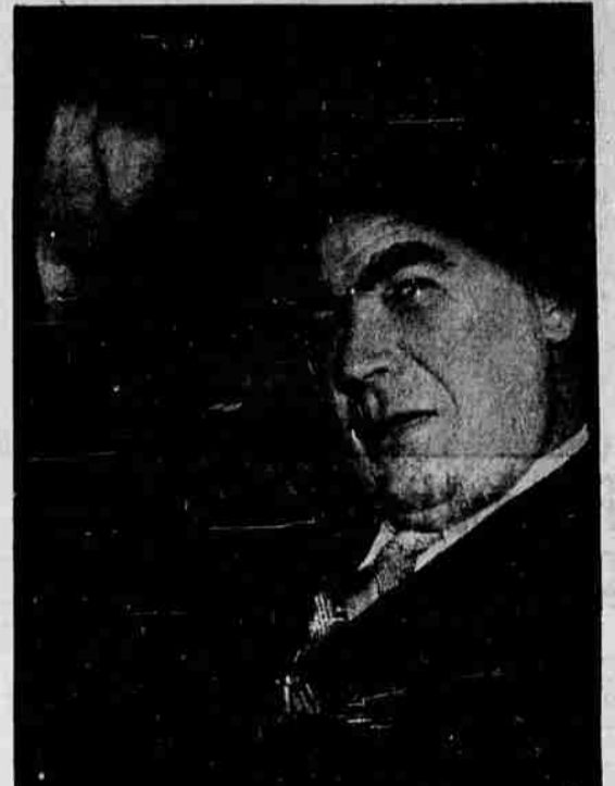
ENVOY'S GESTURE —Soviet Ambassador Georgi Zarubin appears to wave as he leaves Washington talk with Secretary of State John Foster Dulles on atom pool plans conference.