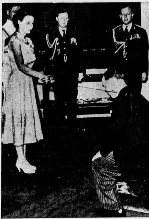
Queen Elizabeth of Britain, following royal tradition, dubs Sir Garfield Barwick, Q.C., at Government House in Sydney, Australia. The Queen is currently touring the British Empire. In London, secret preparations are being made for the Queen and her husband, the Duke of Edinburgh, to visit the United States as President Eisenhower's guest next fall. It was revealed in a story copyrighted by the New York Daily News.