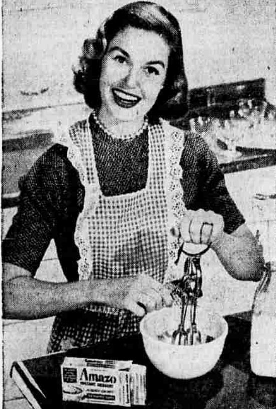
Mix it up for about 30 seconds...