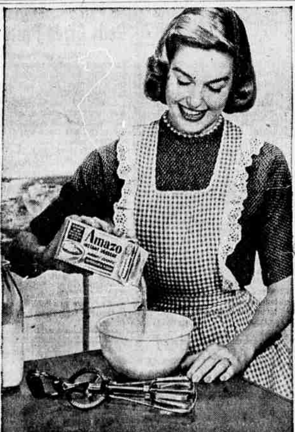
Add Amazo to pint of cold milk..