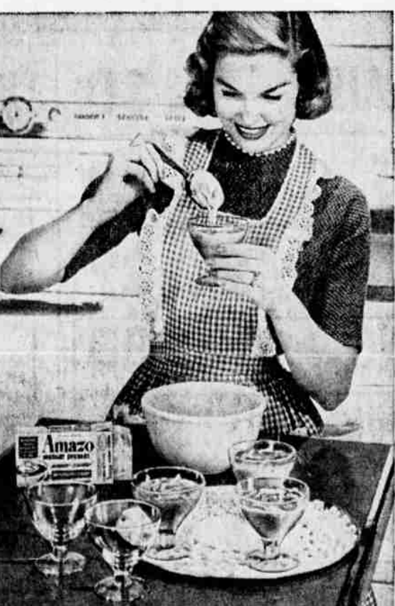
And you have six servings ready to eat!