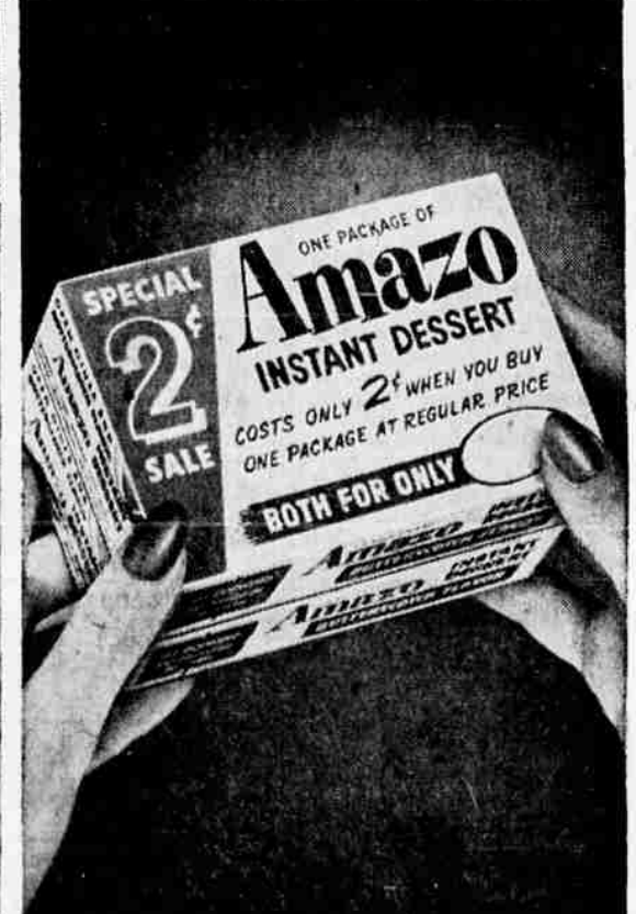
And Amazo is now on special sale. Buy one package