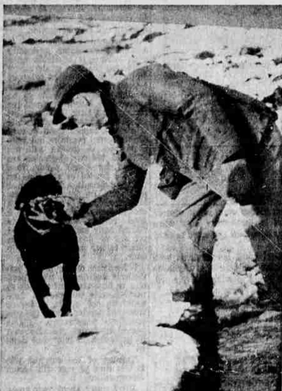
Snow Dog? Snow held no fear for the members of the Willamette Valley Retriever club. Despite snow, they ran their black dogs at Camp Adair last week as scheduled. Above, a contestant takes a live duck from his Labrador retriever.

SPORTS ASSOCIATED PRESS * UNITED PRESS Page 14—Salem, Oregon, Wednesday, January 27, 1954