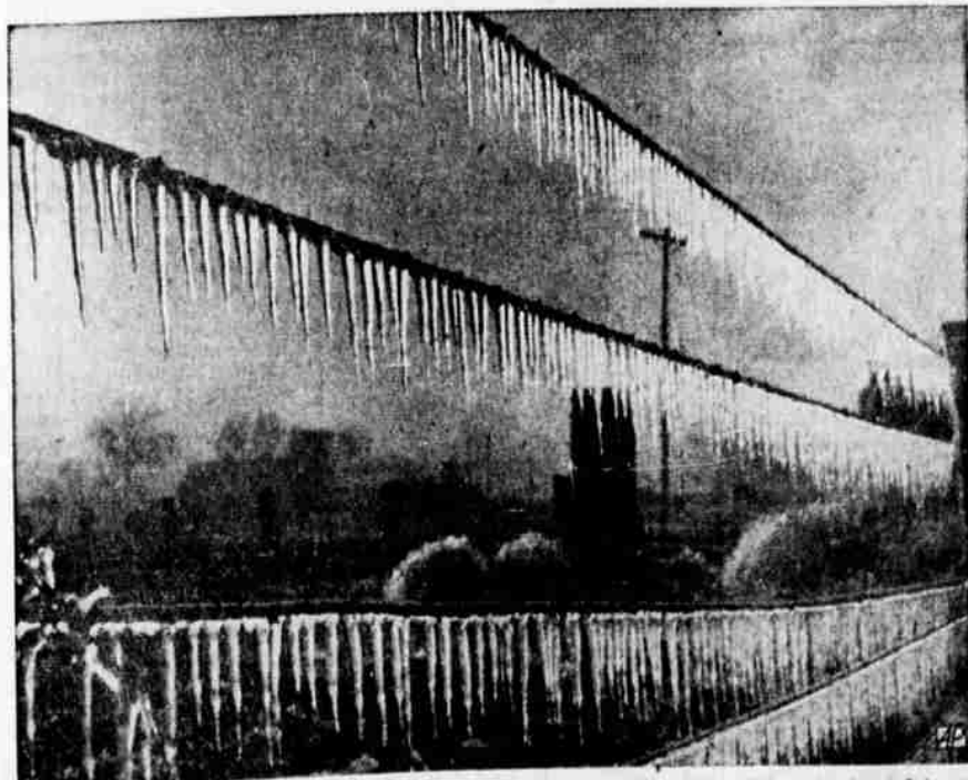
NOT THE USUAL SCENE —Residents of San Bernardino, Cal., were treated to an unusual sight when low temperatures and an unintended sprinkler provided this icy frame.