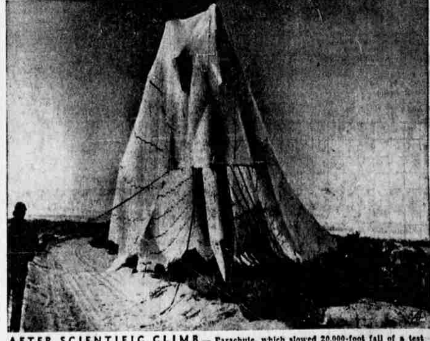
AFTER SCIENTIFIC CLIMB —Parachute, which slowed 20,000-foot fall of a test missile to help it to an upright landing, envelops rocket in California's Mojave desert.