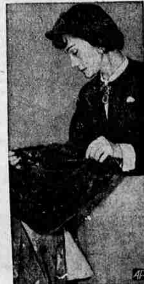
CLOTHES, AGAIN —Famed perfumer Gabrielle Chanel, once a top Paris dressmaker, selects fabrics for the collection with which she will reopen Paris establishment.