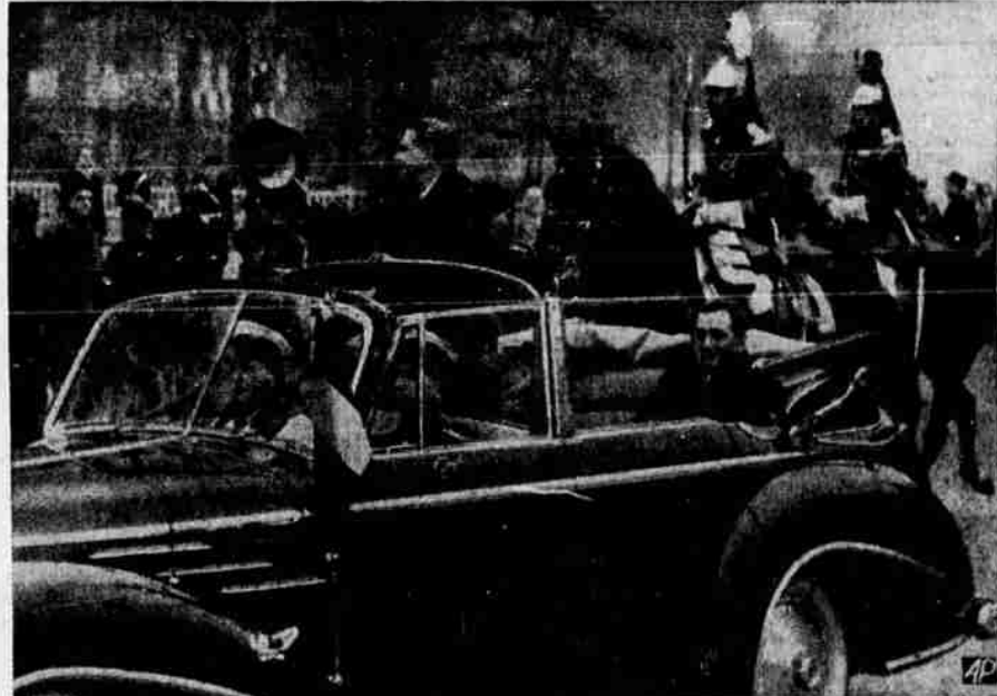
THE NEW AND THE OLD —French President-elect Rene Coty responds to cheers while on way to courtesy call on President Vincent Auriol in Paris. In car is Premier Joseph Laniel.