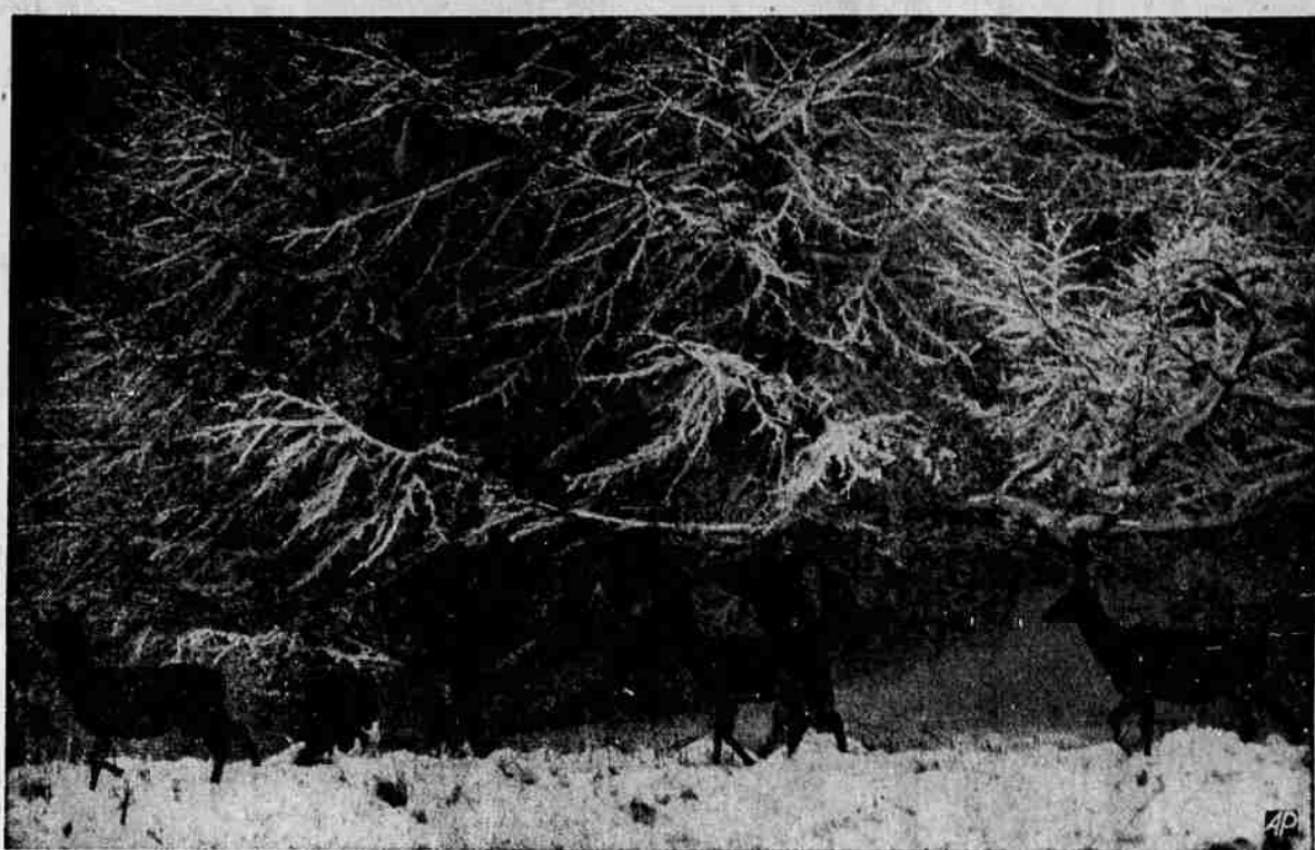
MOTHER NATURE THE SUPREME ARTIST —Snow-covered trees and deer in search of fodder are the ingredients of this winter wonderland scene, unmatched by many artists, in a park near Copenhagen, Denmark, after a recent snowfall.