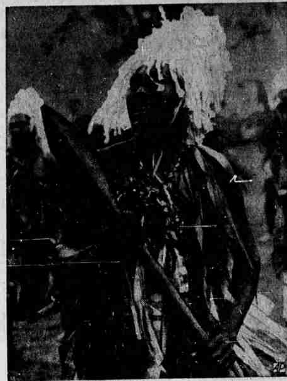
A ROYAL WELCOME —A flower and streamer-decked dancer brandishes his spear as he takes part in reception to Queen Elizabeth and Duke of Edinburgh at Nukualofa, Tonga.