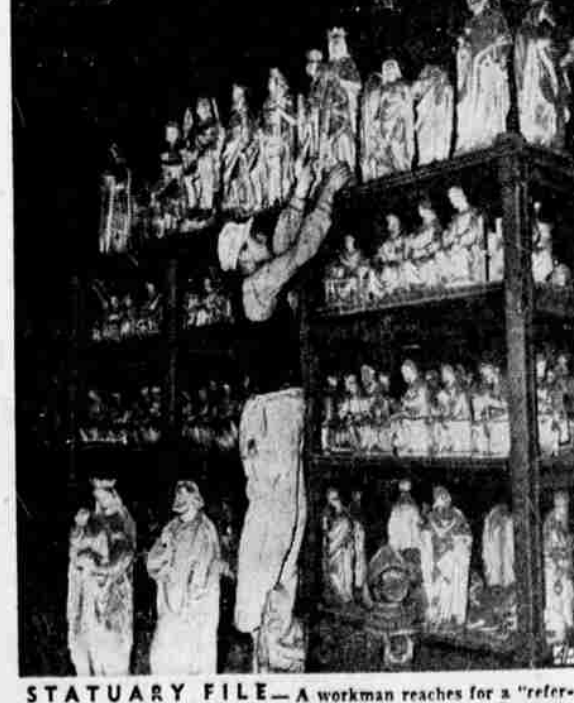
STATUARY FILE —A workman reaches for a "reference copy," one of 800 small-scale copies in Cologne, Germany, Cathedral attic, to check on Cathedral statuary restoration work.