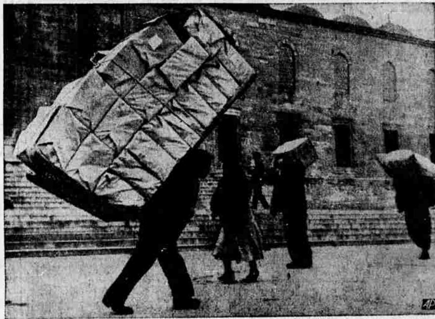
CARRYING HIS SHARE —Turkish porters are noted for their strong backs and this one demonstrates his prowess with a heavy load of boxes on a street in Istanbul.