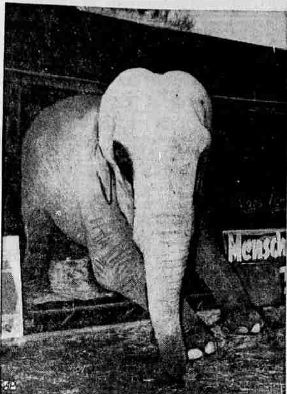
LEAVING AFTER LUNCH —Mary, a 64-year-old elephant, leaves a freight car in Berlin after delaying for a day, the unloading of circus animals by eating their health certificates.