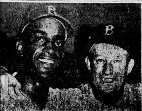
Blames Dressen All was buddy-buddy between Dodger pitcher Joe Black (left) and former Brooklyn manager Chuck Dressen when they posed for this picture in 1952. Black, appearing at the Hickok Award dinner in Rochester, N.Y., charged Dressen with being the reason for his poor pitching performance in 1953. The Giant pitcher said it was Dressen's experiments with his pitching style, and not the "sophomore jinx," which "ruined me last season."