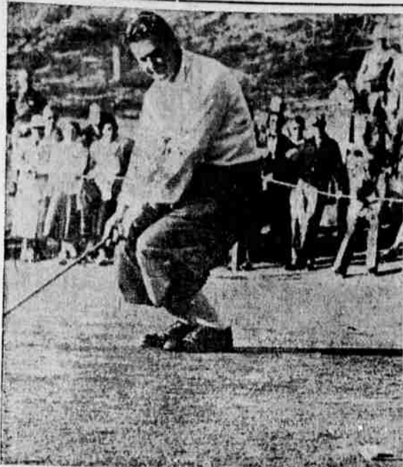
Not Enough English Jimmy Demaret of Klamisha Lake, N.Y., tries to "body English" the ball into the cup on the 18th green at San Diego, Calif., Open Golf Tournament. The ball stopped on the lip of the hole.