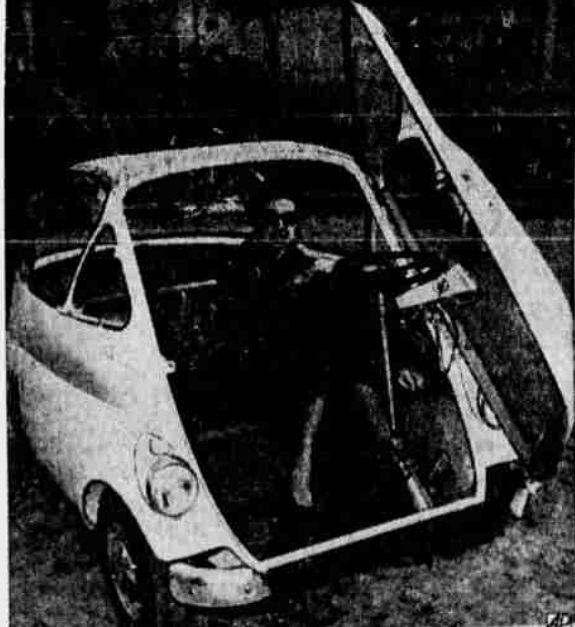
ECONOMY SIZE AUTO —Auto which goes 93 miles on a gallon of gas is the smallest Italian car on market. Manufacturer of tiny car with rear engine and front door is ISO of Milan.