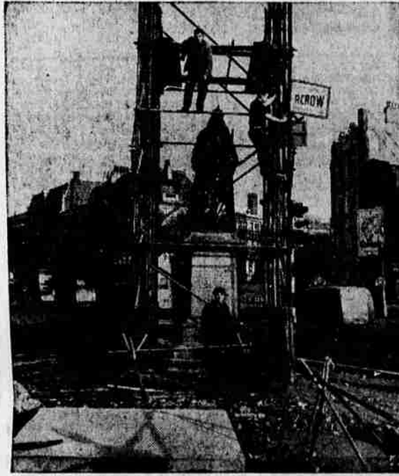
STATUE MOVED —Workmen erect scaffolding around Victoria Statue in London preparatory to moving it five yards to concrete base in foreground. Moving will speed up traffic.