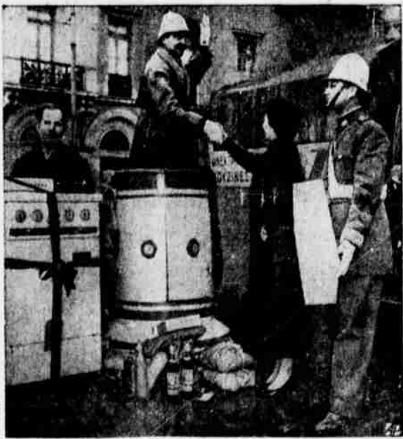
GREETINGS AND GIFTS —A policeman in Athens, Greece, amid presents from motorists, greets a passerby on New Year's Day, a day celebrated more by Athenians than Christmas.