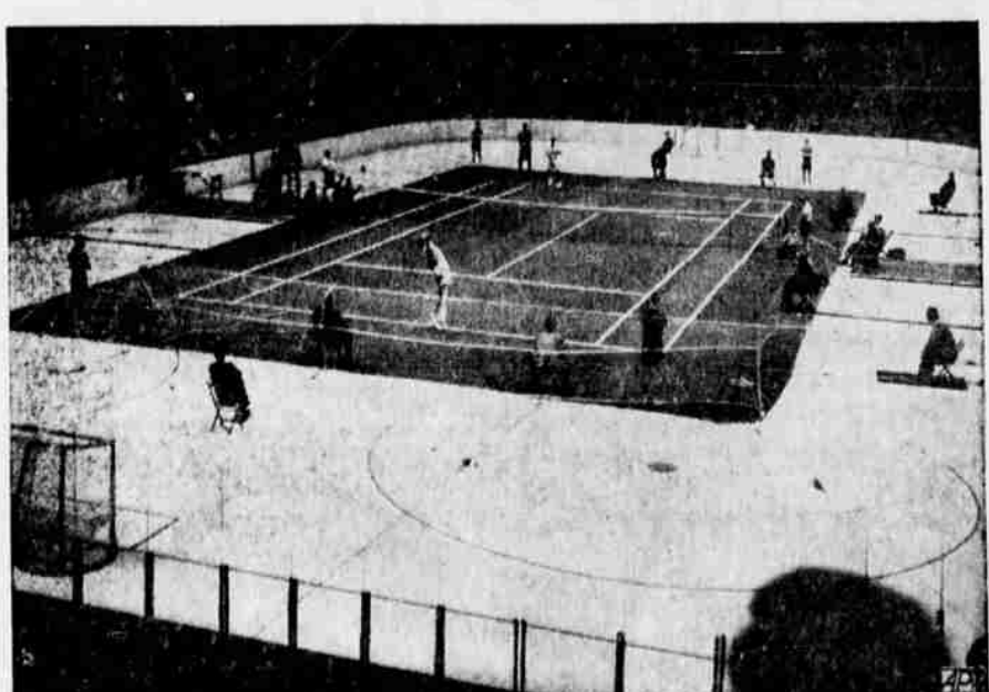
HOCKEY LATER —Pro tennis stars Don Hudge, foreground, and Pancho Segura play after-noon match in New York's Madison Square Garden on mats over ice used for night hockey game.