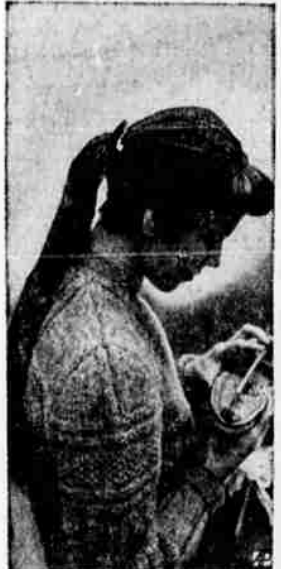
PONY-TAIL HAT —This winter wool cap, worn by Pat Benoit, television player, features a shank of yarn as a tail down the back, held up by a pony-tail clip with button.