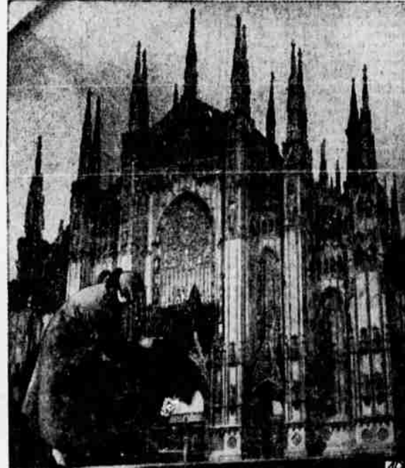
NOTING CHANGES —A visitor to Milan, Italy, Cathedral Museum examines 15th century model of famous church which differs from present day edifice after several restorations.