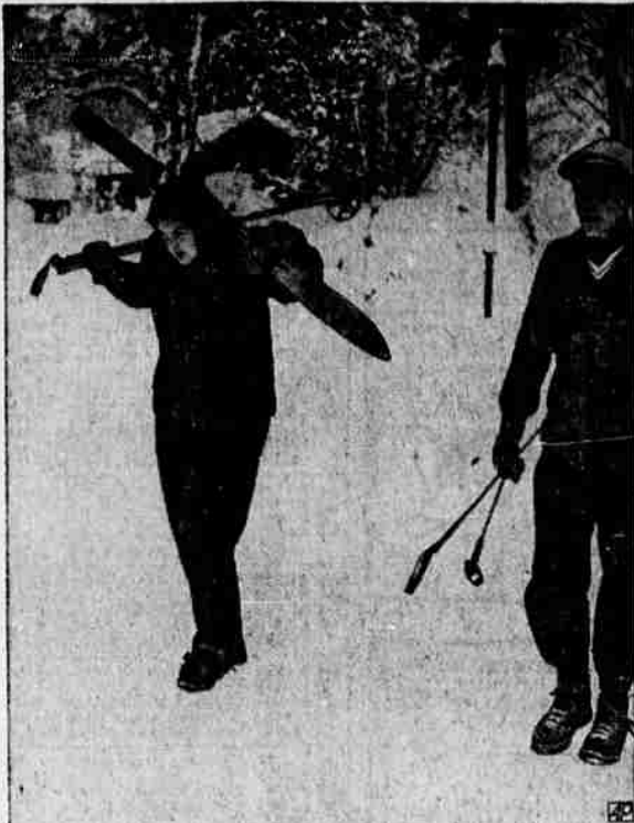
ROYALTY ON WINTER HOLIDAY —Dutch Queen Juliana walks with skis across her shoulders during royal family's winter sports holiday at Grindlewald, Swiss ski resort.