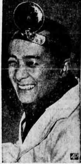
GREAT NEWS —Major Sammy Lee, Olympic diving champ and now an Army doctor in Korea, smiles at news he has been awarded Sullivan Trophy as outstanding amateur athlete.