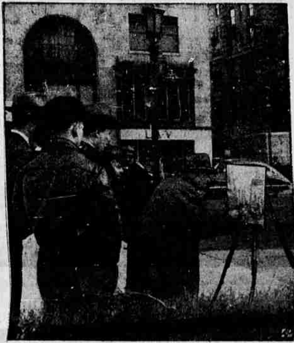
ARTIST AND 'CRITICS' —Passersby study efforts of an artist who set up his easel on Fifth Avenue at 59th Street, New York. His subject was view looking down Fifth Avenue.