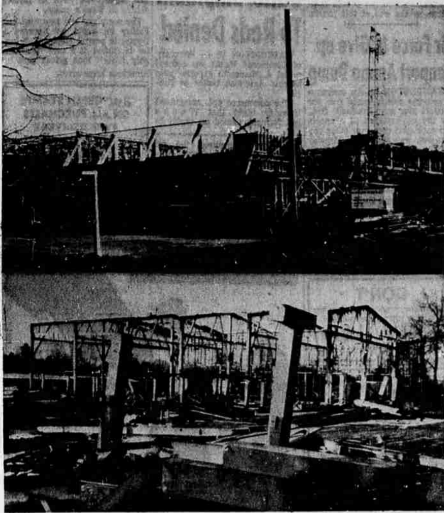
Top view shows new, $200,000 school administration building under construction at 13th and Ferry streets by Viesko Post, prime contractor. Lower picture shows old plant of California Packing corporation near 12th and Trade streets now being dismantled.