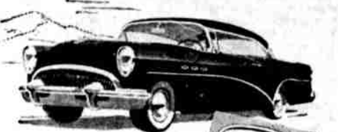
HIGHEST-POWERED CAR of its price in America is the new 200 hp Century—exemplar of Buick's outstanding values for 1954.

Because one look at the sensational new styling of these breath-taking Buicks shows them to be the freshest new automobiles in years. One look into the modern interiors—and through that spectacular new back-swept windshield—firms the conviction. One look at the new V8 power story, the new ride story, the new handling-ease story—practically wraps up the sale. And then, one look at the prices—one eye-opening experience with the