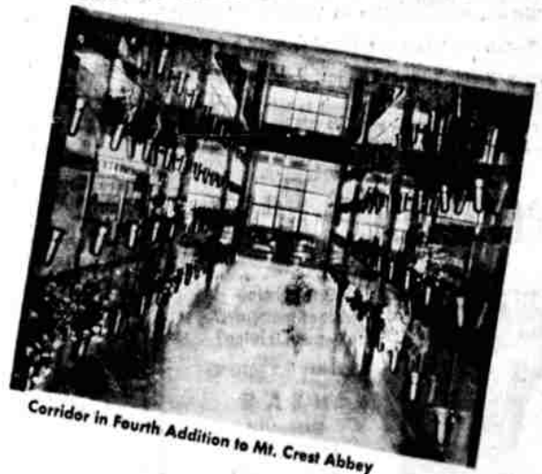
Corridor in Fourth Addition to Mt. Crest Abbey

MT. CREST ABBEY MAUSOLEUM AND CREMATORIUM WEST END OF HOYT STREET — SALEM