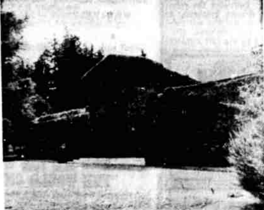
Main Entrance to Mt. Crest Abbey