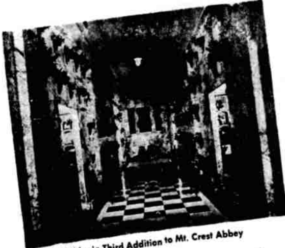
Corridor in Third Addition to Mt. Crest Abbey