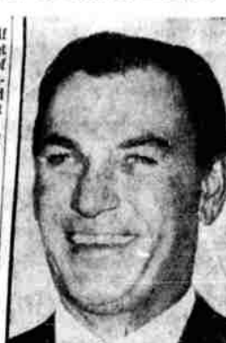
BEN HOGAN ... athlete of year