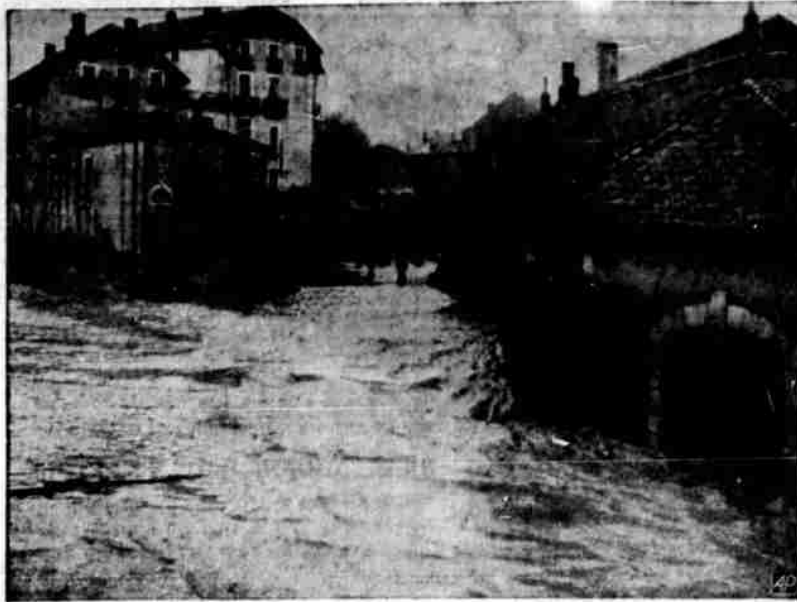
WHEN MOTHER NATURE REBELS—Rescue workers move into flooded streets of Brest, southern France, after River Orde overflowed banks and inundated part of town.