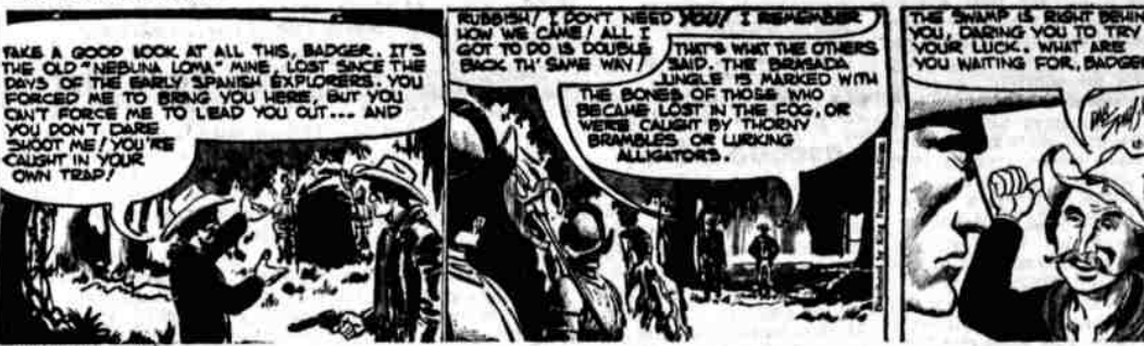
MUTT & JEFF