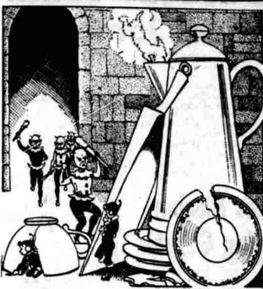
Willie floated over the pot and slid down the spout.

Synopsis: Willie the pup and the two Dreamlins, Mr. Not Much and Mr. Very Little, start searching for the Dreamlin queen in the Gremlin castle.