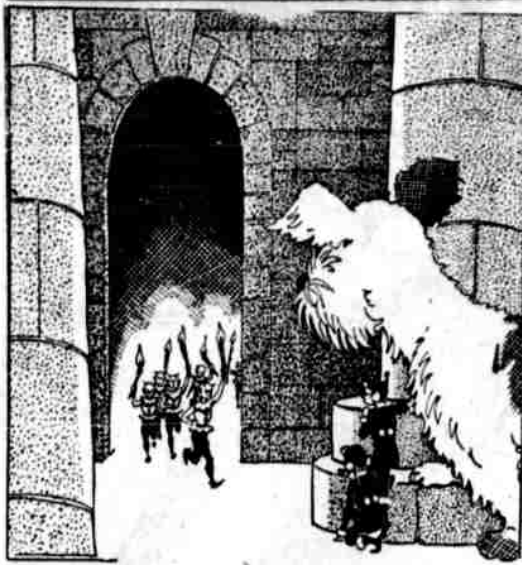
A gang of Gremlins carrying torches burst into the room.

Synopsis: Santa made a magic pill for Willie and the dreamlin queen to take to the Dreamlin queen held by the Gremlins. If the queen would swallow the pill she would change for 10 minutes into a puff of smoke and be able to escape. Willie and the Dreamlin traveled to a giant castle where the queen was a prisoner.