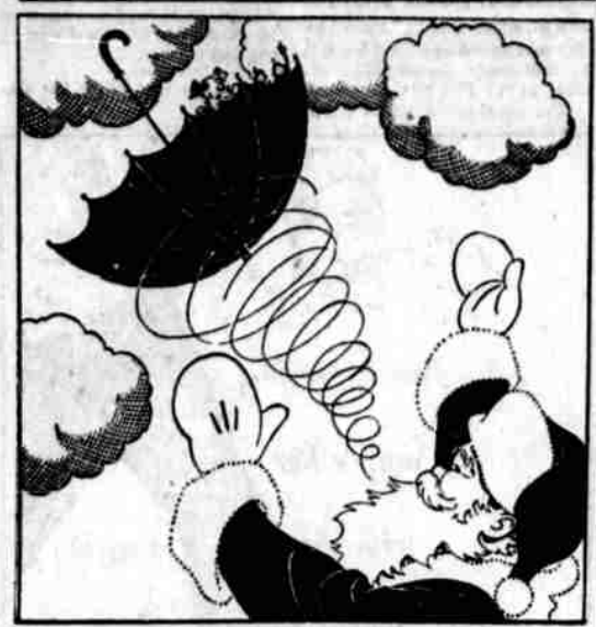
Still twirling, it rose into the sky and whirled away.