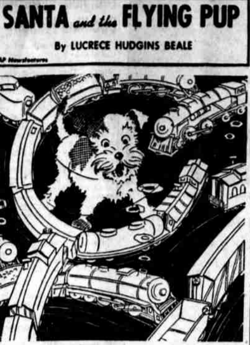
He gazed in astonishment at the furor he had created.

Synopsis: The secret of flying. Santa tells Willie the flying is being able to do an unselfish deed. So Willie takes bones, carrot tops and fruit skins from Santa's garbage can and puts them in front of Patrick Tweedknees' doorway instead of eating them himself.