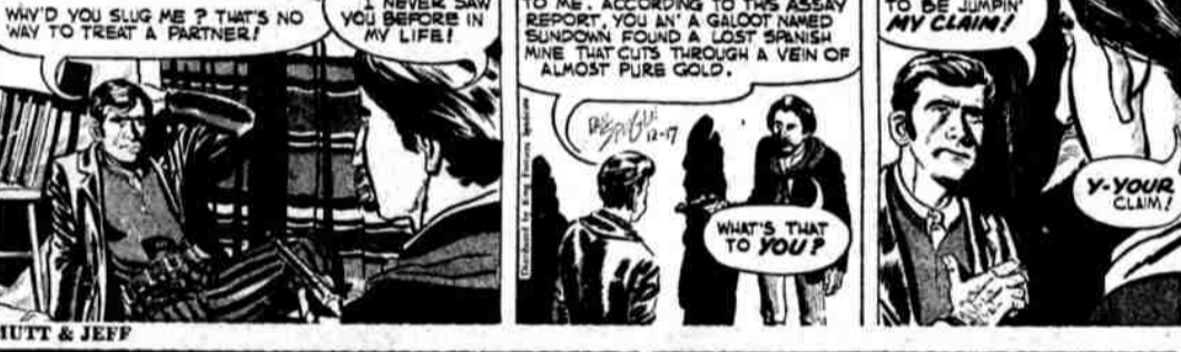
MUTT & JEFF