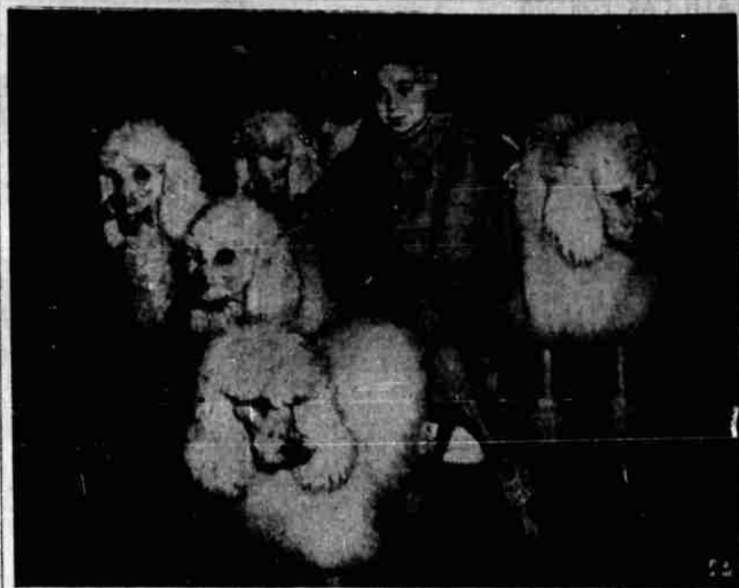
FOLLOW THE LEADER — It's a moot point whether the little boy is leading these white French poodles or they're taking him to a Paris dog show where three were entries.

Vicksburg, Miss. (AP) — The death toll rose to 35 Monday in the wake of a tornado that smashed 12 blocks of this Mississippi river city.