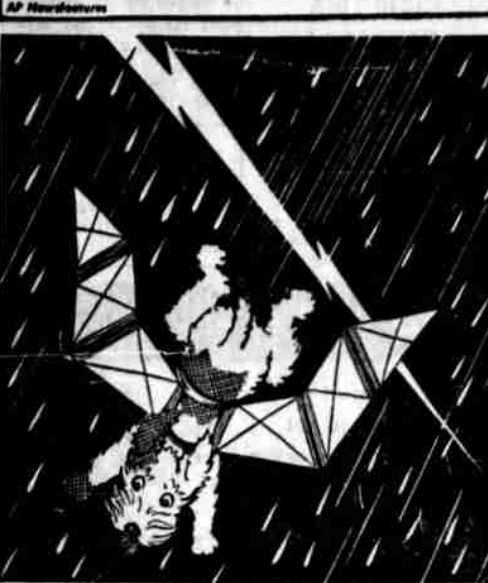
Willie hurtled toward the ground in a torrent of rain.

Synopsis: The Dreamliners, Mr. Not Much and Mr. Very Little, worry about their quest, who is being held by Gremlins. While they are waiting for Santa to help them rescue her, they make a pair of wings for Willie the pup. Willie climbs a high mountain to try to see him, when he jumps off the mountain, he falls smack in the middle of a puffy white cloud and is swept away.