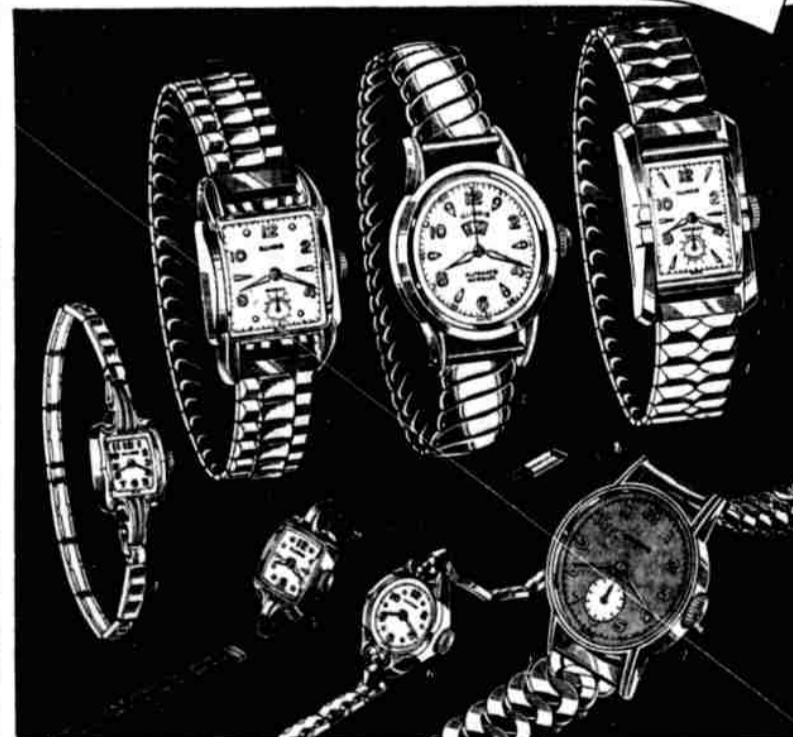
1. COQUETTE "A"—17 jewels, anti-magnetic, yellow or white gold-filled case, matching bracelet, $57.50; silk cord, $49.95. 2. DEBONAIR "C"—17 jewels, shockproof, anti-magnetic, domed crystal, expansion band, $47.50; leather strap, $39.95. 3. SIGNAMATIC—17 jewels, stainless steel case, waterproof, automatic with reserve power indicator, expansion band, $69.95; leather strap, $60.00. 4. TOPPER "B"—17 jewels, shockproof, anti-magnetic, gold-filled case, expansion band, $52.50; leather strap, $44.95. 5. GOLDEN TREASURE "A"—17 jewels, anti-magnetic, yellow or white 10K gold case, silk cord, $54.95. 6. COQUETTE "C"—17 jewels, white or yellow gold-filled case, matching bracelet, $52.50; silk cord $44.95. 7. DEBONAIR "D"—17 jewels, shockproof, anti-magnetic, expansion band, $39.95; leather strap $33.95.

Dollar for dollar, we sincerely feel these are the most beautifully designed, dependable, accurate—and modern—watches you can buy. Choose from shockproof, waterproof, self-winding watches... watches with sweep second hands... all styled by Hamilton and guaranteed by Hamilton. Wouldn't one of these new Illinois watches be a perfect gift for that special name on your Christmas list?