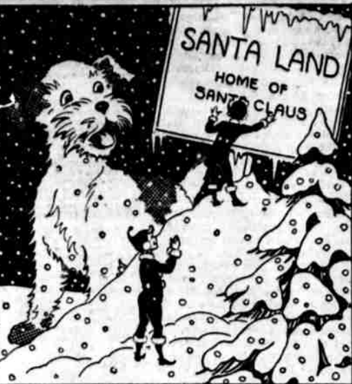
Willie wasn't the least bit tired any more.

Synopsis: Willie, the pup, tired of being hanged from one person to another, sets off to find adventure. He meets Mr. Not Much and Mr. Very Little, who say they're on a very important errand and invite Willie to come along.