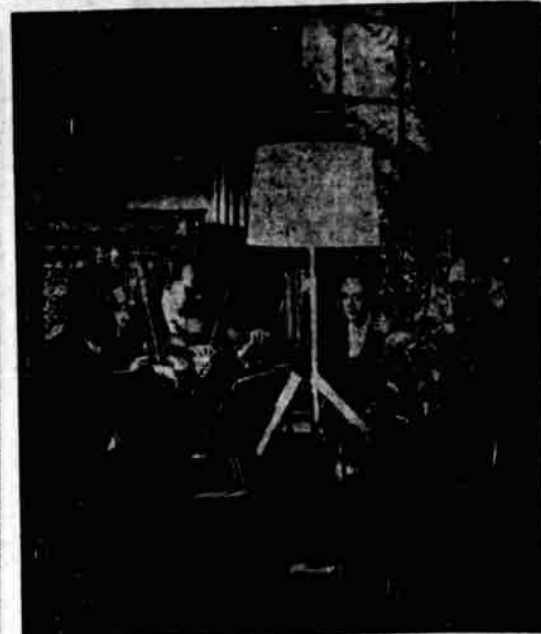
Due Here Dec. 9 — The Paganini Quartet, above, appears here next Wednesday, December 9, for the next concert of the Salem Community Concert association. The event will be at Salem senior high school auditorium for association members only.

DON ALLEN STUDIO 155 South Liberty Phone 2-7523