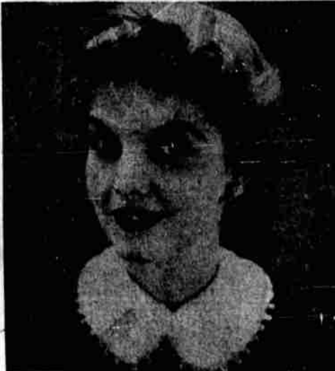
ROYAL ERMINE JEWELLED COLLAR... fit for your Christmas queen! This year's important accessory, she'll wear it with elegance on her dress, sweater, suit or coat. Designed by WINTER FURS, in snowy ermine or dark, ranch mink, richly bordered with braid and simulated pearls.