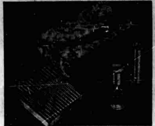
For the ultimate in glamour and fashion, LENTHERIC has designed an exquisite brocade evening bag in beige and gold. Neatly tucked inside are a square-shaped gold compact, a one-dram size purse flacon of Tweed perfume, and Lentheric lipstick. And there's room for hanky and keys, too. A wonderful gift for someone very special.