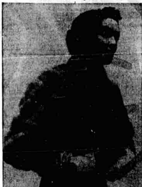
Christmas dreams are made of mink—and every woman will thrill to a fur fashion that can be worn the year-around for day or evening smartness. Above: FREDERICA'S Breath of Spring mink spencer jacket with dolman sleeves and snug waist.