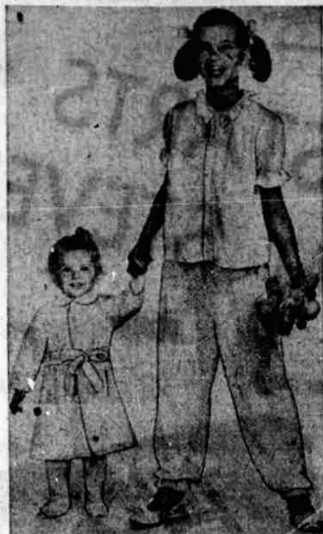
From toddler to teen, VANTA styles warm comfortables for at-ease, lounge-about and "dream times." Made of soft, cuddly cottons, these easy-to-care-for garments are welcome gifts at Christmas time or any time.