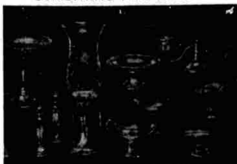
Something special for every home maker on your list—is a gift of sterling, holloware or silverplate (according to your budget, and her taste). Famous makers offer a wonderful selection for your choosing for gracious gift-giving. Sugar and creamer sets, salt and pepper sets, baskets, candlestick holders, trays, compotes, coffee and tea sets—are but a few of the great "silver" variety shown.