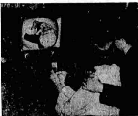
Fortunate indeed, will be the family who receives a beautiful Television set this Christmas. Here, Admiral presents a compact, handsome console set with 21" screen. This set is available in walnut, mahogany and blond finish.