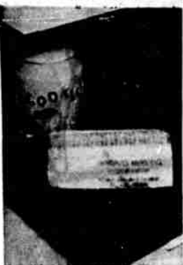
Rose Valley cheese made at Mt. Angel and sold locally is something from this area for those feasts and gatherings held at Christmas.