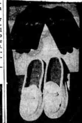
Salem-made gloves and moccasins could be included on a Christmas gift list.