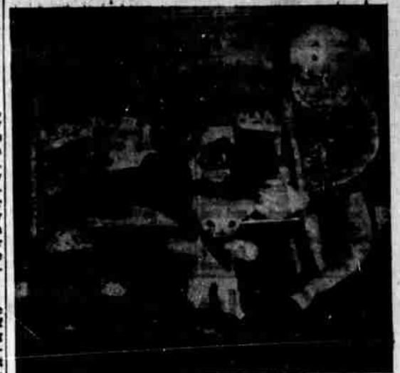
Stuffed animals and a rag doll are among the locally made gifts suitable for little children. Here the toys are shown in a locally made cradle.