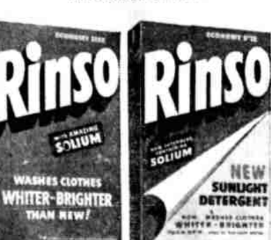
SOAP-in the DETERGENT- in the big Green Package Green and Yellow Package

Your grocer now has Rinso Soap on sale at special low prices so you save more than ever!