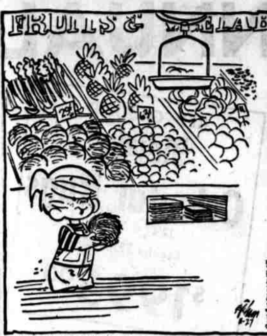
"HEY, DAD! LOOK AT THE HAIRY BOWLING BALLS!"