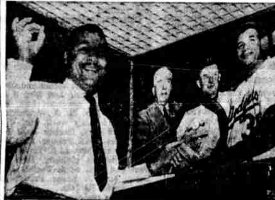
Repeat Performance Roy Campanella wears Brooklyn Dodger catcher's broad smile as he learns that he has been voted the National League's most valuable player for the past season. It was Roy's 32nd birthday also. He stands on ladder in his Harlem, New York, liquor store here pointing to photo mural of presentation of same award for 1951. With Roy in photo are National League president Warren Giles and Charley Dressen, then Dodger manager.

"I have decided to give the university $2,225,000 in oil payments."