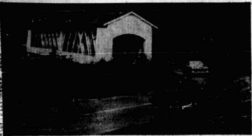
Distinguished Linn county covered bridge over the South Fork of the Santiam on Quartzville road is a true type structure built about 1936. Although covered in the conventional manner, Middle Fork bridge at Foster is not sided, a concession to traffic safety.