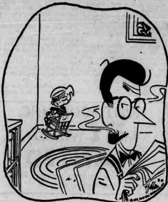
*WHO DID YOU PUSH AROUND BEFORE 'YA GOT ME?'