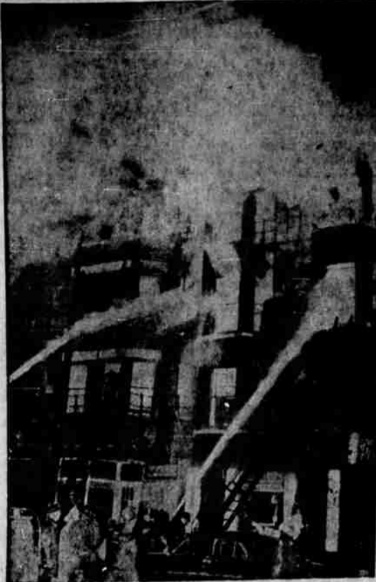
Firemen direct streams of water into blazing Chicago tenement building where at least 14 persons died, including six small children. Firemen said the fire may have been caused by a cigaret.