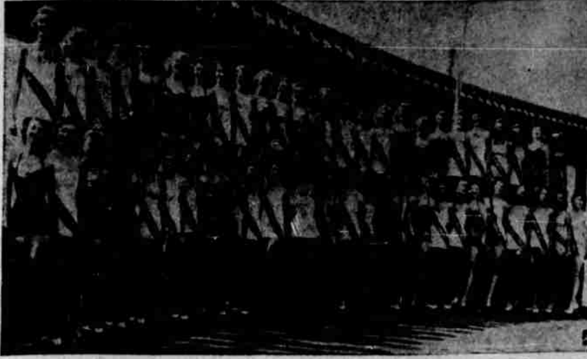
Fifty-two candidates for the coveted title of "Miss America" line up for a panoramic shot on the boardwalk at Atlantic City, N. J., to mark start of the week-long contest. Miss America will be crowned September 12. "Miss America of 1953," Miss Neva Jane Langley, the past year's winner, is in center, front row, wearing a light banner.