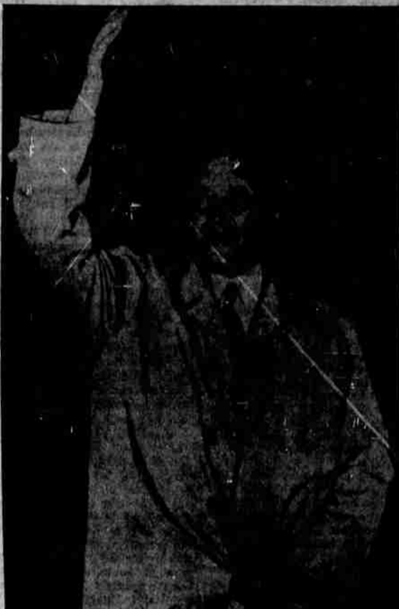
Chancellor Konrad Adenauer of West Germany, leader of the Christian Democrats, waves to supporters in Essen, Germany, after attending an election rally. He expressed confidence of victory despite a closing rush from the Socialists, the nation's second biggest party.