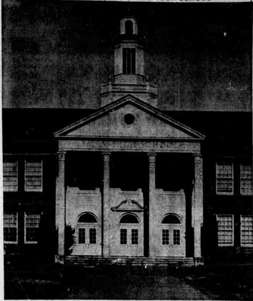
Senior high school in East Salem was erected about 15 years ago when classical style for school structure was in vogue. It is now overcrowded and will soon be supplemented by new South Salem high school now under construction.