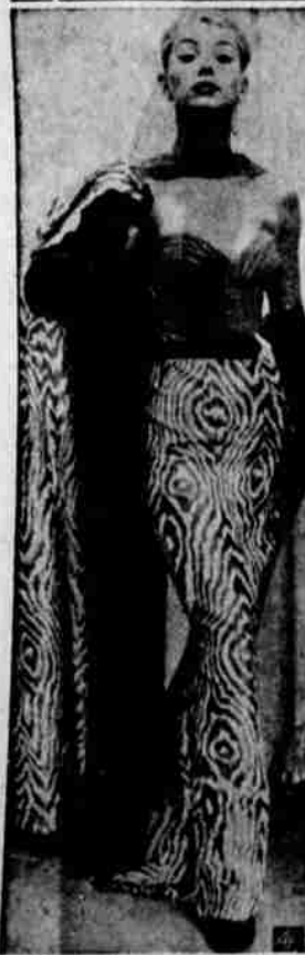
Zebra Stripes—Paris fashion designer Pierre Balmain has included this slim evening dress in his creations. It was shown in a recent Paris fashion show. The dress is in gray and black zebra stripes with a red draped muslin bodice worn with a black wool evening coat lined with the same zebra material.

In boys' casual wear, there are many real news-makers! Watch for black gabardine slacks with double saddle stitching in white . . . slacks with tapered legs . . . flannel slacks in the lighter — ice cream shades . . . slacks with matching belts . . . the more dressed-up look in knit shirts . . . vests in corduroy, knits.