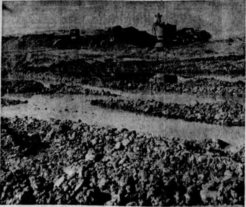
Gravel now being removed from a barrow pit near the clover leaf joining North Santiam and East Salem by-pass route. Vernie Jarl, Gresham contractor, has a contract calling for removal of near 70,000 yards and is excavating thousands of yards daily. Completion of the by-pass route and the clover leaf will remove enough gravel from this barrow pit to make a recreational lake several acres in extent.