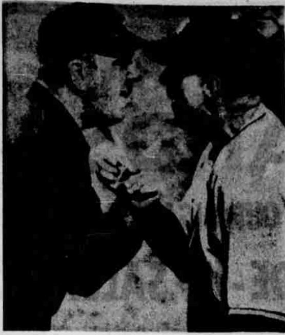
Now You Listen! Giant manager Leo Durocher (right) and umpire Tom Gorman duel with pointed fingers during heated argument in New York. The verbal battle was brought on when Dodger catcher Roy Campanella complained of being pitched too close to in second inning. The Dodgers ran their consecutive streak to 11 straight by beating the Giants in 11 innings, 4-3. Tom and Leo came out a draw.