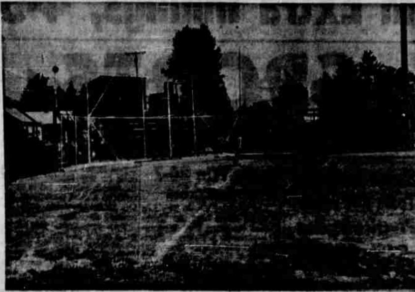
Softball Center View of Allen field, Mill City, where the state softball tournament will be held starting Saturday and lasting five days. Sunday night's double header has been designated "Shrine Night". All proceeds from this event will be given to the Shrine hospital for crippled children in Portland. The Salem Shrine band and patrol will put on a between-the-games exhibition. Game time Sunday is 7:30.