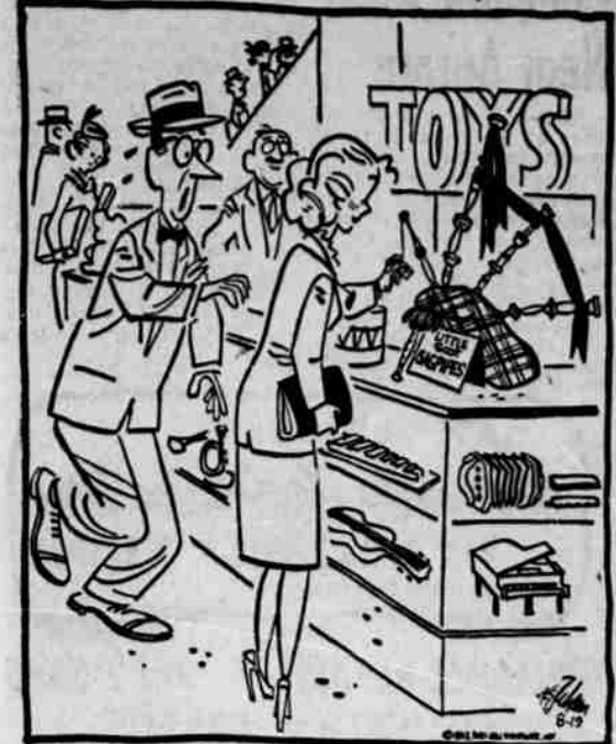
"Alice! Have you lost your mind?"