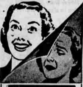
How Lydia Pinkham's works. It has a "cooling" and soothing effect on the uterus... quieting the contractions (see the chart) that so often cause menstrual pain, cramps, other distress.

Here's wonderful news for women and girls who—each month—suffer the tortures of "bad days" of functionally-caused menstrual cramps and pain—headaches, backaches, and those "no-good," dragged-out feelings. It's news about a medicine famous for relieving such suffering! Here is the exciting news. Lydia E. Pinkham's Vegetable Compound—gave complete or striking relief of such distress in an average of 3 out of 4 of the cases in doctors' tests! Yes! Lydia Pinkham's has been proved to be scientifically modern in action!