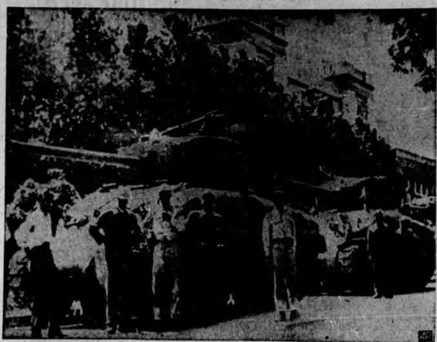
Iranian army troops and tanks stand by in front of Central Police Headquarters in Tehran, capital of Iran, following unsuccessful attempt by followers of Shah Mohammed Reza Pahlavi to oust aged Premier Mohammed Mossadegh.