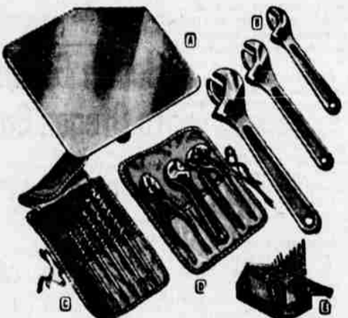
Your choice 2.22 Each